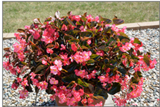
Megawatt Pink Bronze Leaf Begonia in bloom

Megawatt Pink Bronze Leaf Begonia is a fine choice for the garden, but it is also a good selection for planting in outdoor containers and hanging baskets. With its upright habit of growth, it is best suited for use as a 'thriller' in the 'spiller-thriller-filler' container combination; plant it near the center of the pot, surrounded by smaller plants and those that spill over the edges. It is even sizeable enough that it can be grown alone in a suitable container. Note that when growing plants in outdoor containers and baskets, they may require more frequent waterings than they would in the yard or garden.