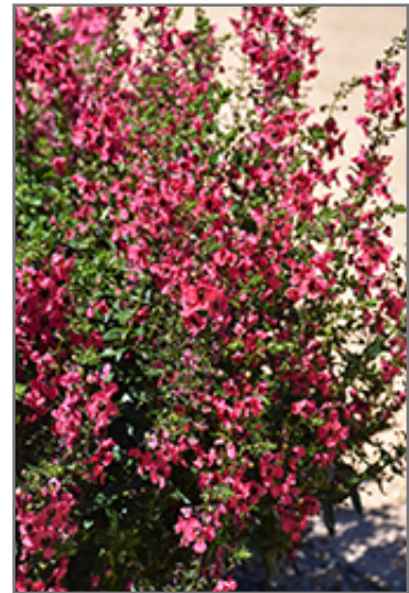
Archangel Cherry Red Angelonia flowers

Archangel Cherry Red Angelonia is an herbaceous annual with an upright spreading habit of growth. Its relatively fine texture sets it apart from other garden plants with less refined foliage.