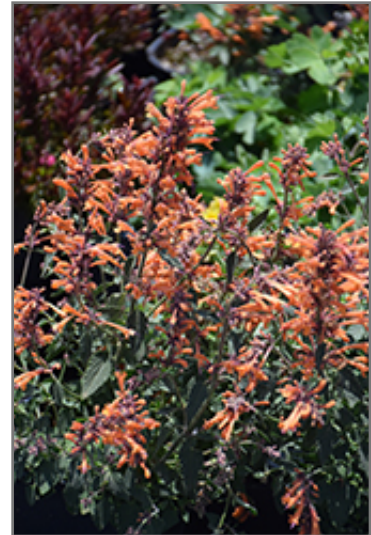
Kudos Mandarin Hyssop flowers