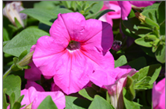
Easy Wave Pink Passion Petunia flowers

Easy Wave Pink Passion Petunia is recommended for the following landscape applications;