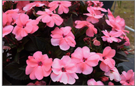
SunPatiens Compact Coral Pink New Guinea Impatiens flowers

This plant will require occasional maintenance and upkeep, and should not require much pruning, except when necessary, such as to remove dieback. It is a good choice for attracting bees and butterflies to your yard. It has no significant negative characteristics.