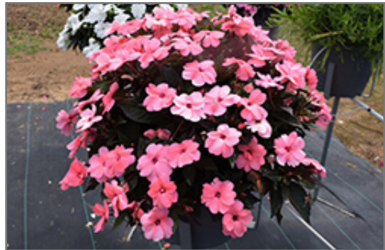
SunPatiens Compact Coral Pink New Guinea Impatiens in bloom