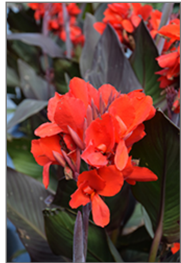
Cannova Bronze Scarlet Canna flowers

This plant is native to the tropics and prefers growing in moist environments with evenly warm conditions all year round. In our climate, it is usually grown as an outdoor annual in the garden or in a container. If you want it to survive the winter, it can be brought in to the house and provided with special care, and then returned to the garden the following season. In its preferred tropical habitat, it can grow to be around 4 feet tall at maturity, with a spread of 20 inches. However, when grown as an annual or when overwintered indoors, it can be expected to perform differently, and its exact height and spread will depend on many factors; you may wish to consult with our experts as to how it might perform in your specific application and growing conditions.