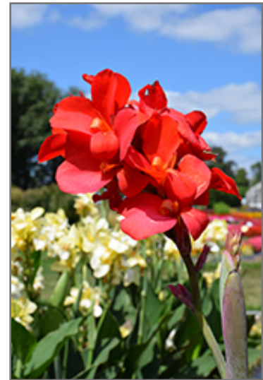
Cannova Bronze Scarlet Canna flowers

Cannova Bronze Scarlet Canna is a fine choice for the garden, but it is also a good selection for planting in outdoor pots and containers. With its upright habit of growth, it is best suited for use as a 'thriller' in the 'spiller-thriller-filler' container combination; plant it near the center of the pot, surrounded by smaller plants and those that spill over the edges. It is even sizeable enough that it can be grown alone in a suitable container. Note that when growing plants in outdoor containers and baskets, they may require more frequent waterings than they would in the yard or garden. Be aware that in our climate, this plant may be too tender to survive the winter if left outdoors in a container. Contact our experts for more information on how to protect it over the winter months.