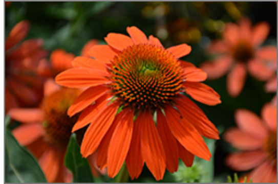
Sombrero Adobe Orange Coneflower flowers

Sombrero Adobe Orange Coneflower will grow to be about 24 inches tall at maturity, with a spread of 18 inches. Its foliage tends to remain dense right to the ground, not requiring facer plants in front. It grows at a medium rate, and under ideal conditions can be expected to live for approximately 10 years. As an herbaceous perennial, this plant will usually die back to the crown each winter, and will regrow from the base each spring. Be careful not to disturb the crown in late winter when it may not be readily seen!