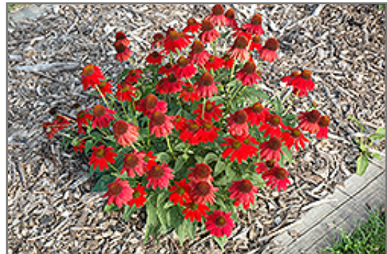
Sombrero Salsa Red Coneflower in bloom

Sombrero Salsa Red Coneflower will grow to be about 16 inches tall at maturity extending to 24 inches tall with the flowers, with a spread of 24 inches. Its foliage tends to remain dense right to the ground, not requiring facer plants in front. It grows at a medium rate, and under ideal conditions can be expected to live for approximately 10 years. As an herbaceous perennial, this plant will usually die back to the crown each winter, and will regrow from the base each spring. Be careful not to disturb the crown in late winter when it may not be readily seen!