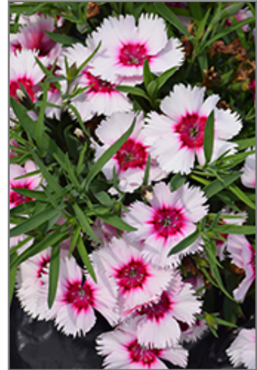
Super Parfait Raspberry Pinks flowers

Super Parfait Raspberry Pinks is a fine choice for the garden, but it is also a good selection for planting in outdoor pots and containers. It is often used as a 'filler' in the 'spiller-thriller-filler' container combination, providing a mass of flowers and foliage against which the thriller plants stand out. Note that when growing plants in outdoor containers and baskets, they may require more frequent waterings than they would in the yard or garden.