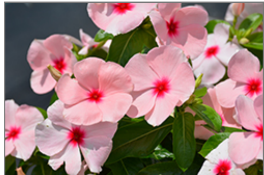
Titan Apricot Vinca flowers

Titan Apricot Vinca is recommended for the following landscape applications;