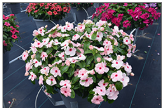
Titan Apricot Vinca in bloom