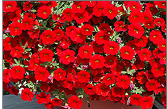
Cabaret Bright Red Calibrachoa flowers

Cabaret Bright Red Calibrachoa is recommended for the following landscape applications;