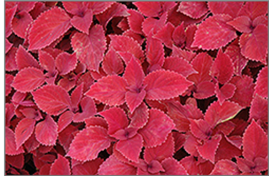
Redhead Coleus foliage